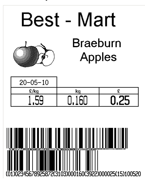
Figure 4-2 To-Be label using a GS1 DataBar Expanded Stacked encoding GTIN plus additional data

Note: The sample above is not actual size and is for example only. Reference Section 5 -Table 1 in the GS1 General Specifications for symbol specifications.